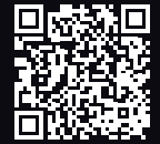
RUT271 360° VIEW