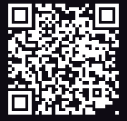
RUT206 360° VIEW

The RUT206 is a compact industrial router that supports RS232 and RS485 serial interfaces, along with both active and passive PoE inputs. Its rugged design, 2-pin power input, and expandable data storage via a microSD slot make it an ideal choice for a range of IoT and M2M applications. This 4G Cat 4 router comes with RutOS open-source software and supports key industrial protocols like Modbus, DNP3 and DLMS.