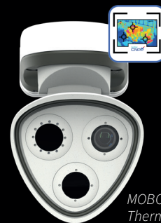
MOBOTIX M73 Thermal TR App incl.