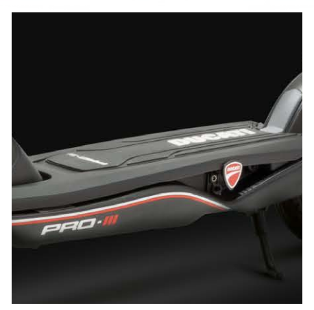
Up to 50km of range, 468Wh battery