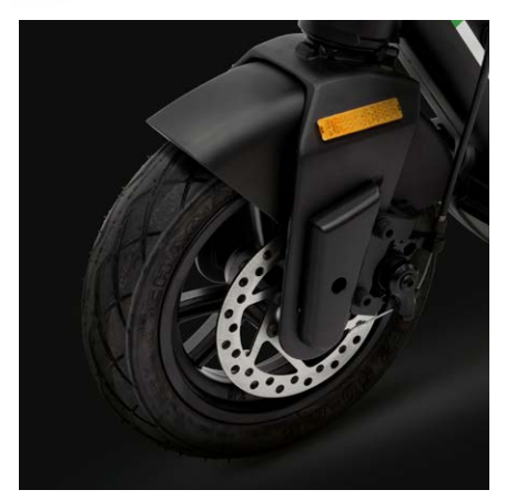
Front and rear disk brake